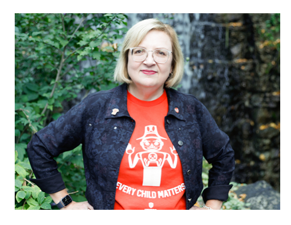
In honour of the National Day for Truth and Reconciliation, Unifor members across the country wore orange t-shirts.