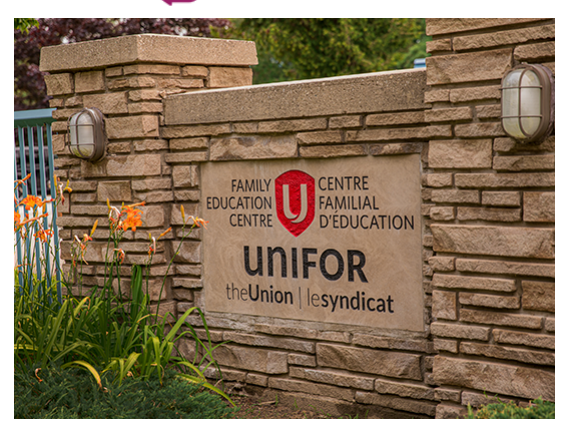
Registration is open for Unifor's fall and winter Area Schools.