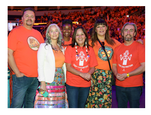
Unifor members and their families marched and participated in Winnipeg's Orange Shirt Day powwow.