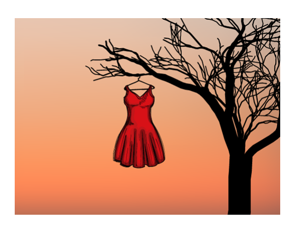
October 4 serves to commemorate the lives of missing and murdered Indigenous women, girls, and two-spirited persons.