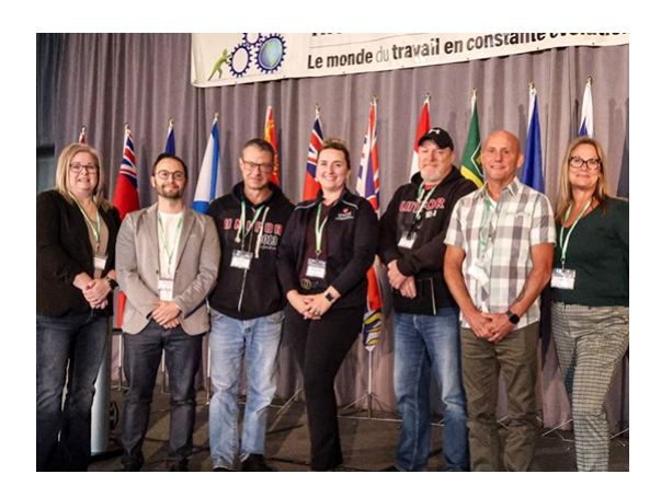
Unifor health and safety activists attended a two-day forum hosted in Halifax.